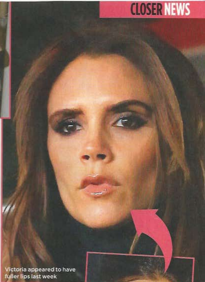
Victoria appeared to have fuller lips last week