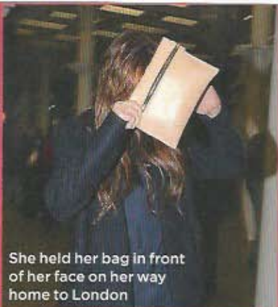
She held her bag in front of her face on her way home to London